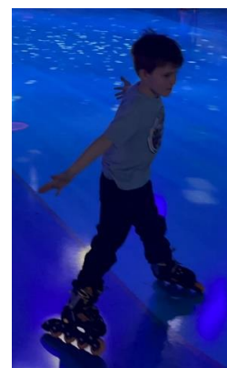
Good time was had by all!