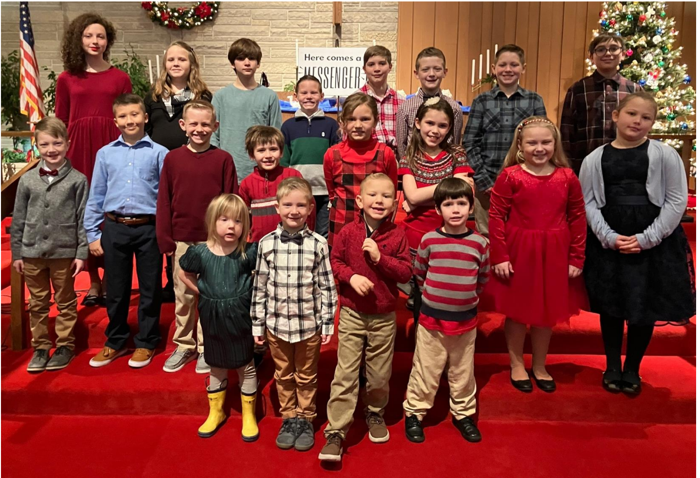
Sunday School Christmas Program – Here Comes the Messenger

Thanks to everyone who made 2023 a great year for our church.